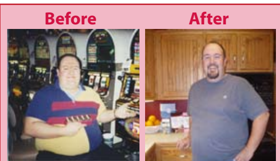
Results not typical. The average weight loss with RESET is 4.5 lbs. in five days.

"USANA's RESET program was the catalyst I needed to jump start my weight-loss journey of losing over 110 pounds. After seeing results with RESET , I gained confidence in myself, which led to making better decisions when it came to my health. USANA's products are changing my life."